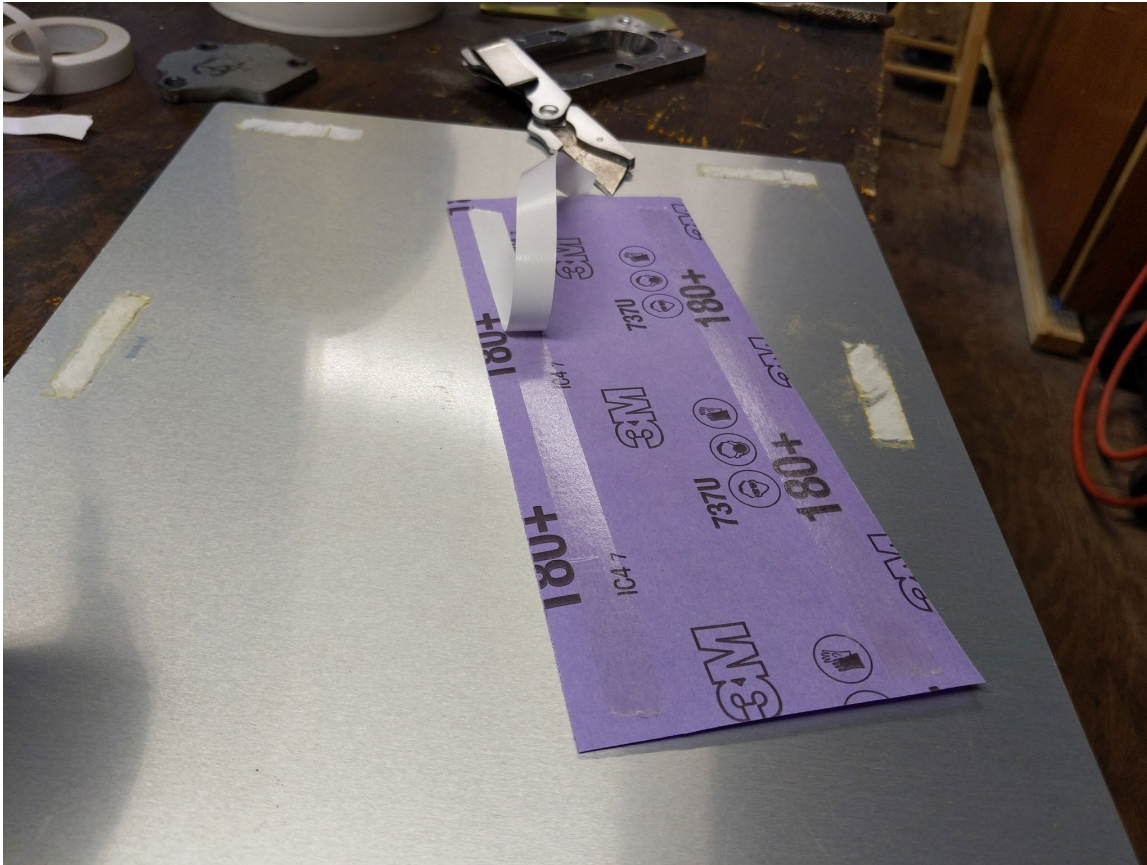
Thin double-sided tape