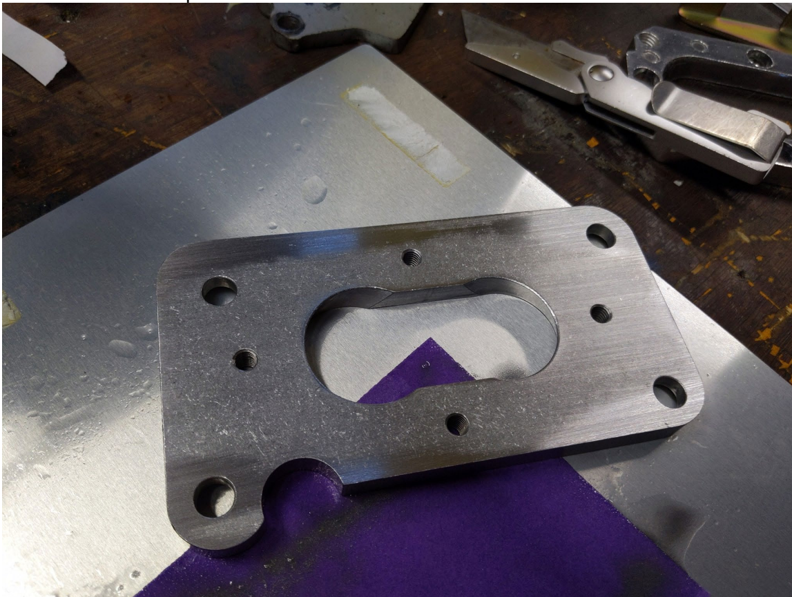
Highs and lows visible